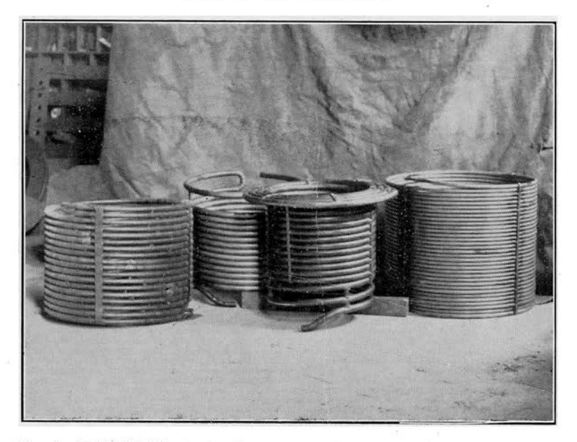
Fig. 4.—THE COILS OF THE LESLIE BOILER BEFORE ASSEMBLY. Although it does not show in the picture, the coil on the extreme left is made of finned tubing.

quietness, acceleration, smoothness and hill climbing ability are in distinct advance of our best petrol cars, the designers are continuing with the testing and refinement of the car. There is no necessity to get something on the market in a hurry, and nothing guides the designers at present but the desire to perfect every detail of the car. With this in mind, work is progressing along the following lines.