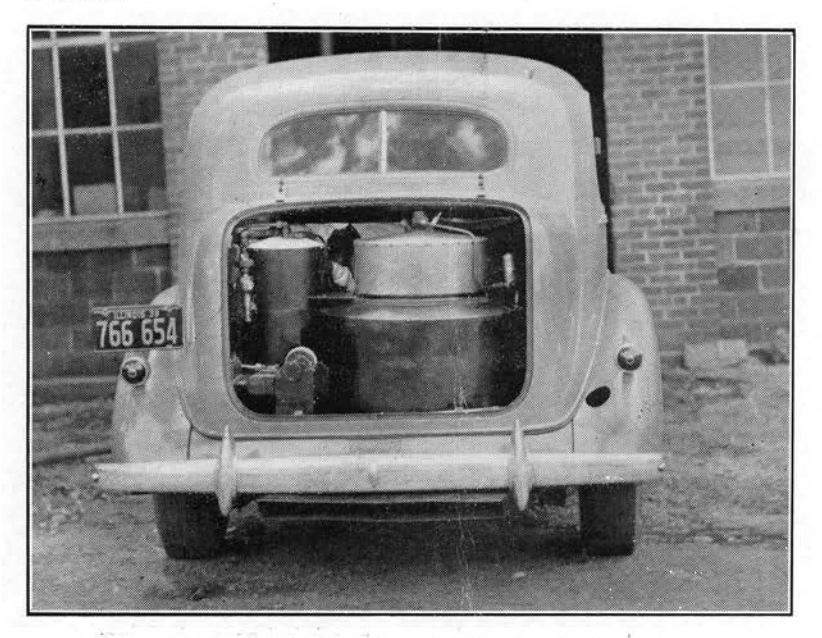
Fig 3.—REAR VIEW OF THE LESLIE CAR, SHOWING THE NEW BOILER.

The engine is exceedingly smooth and quiet, very powerful, and for the past two years has been giving an excellent account of itself.